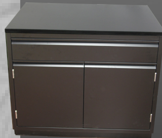
S-BENCH with single double unit cabinet