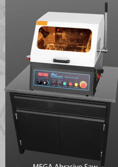
MEGA Abrasive Saw Support Bench