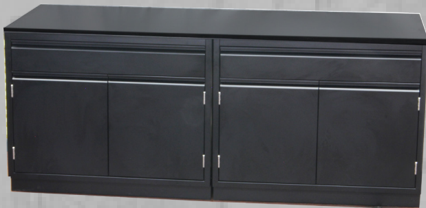
L-BENCH with two double unit cabinets