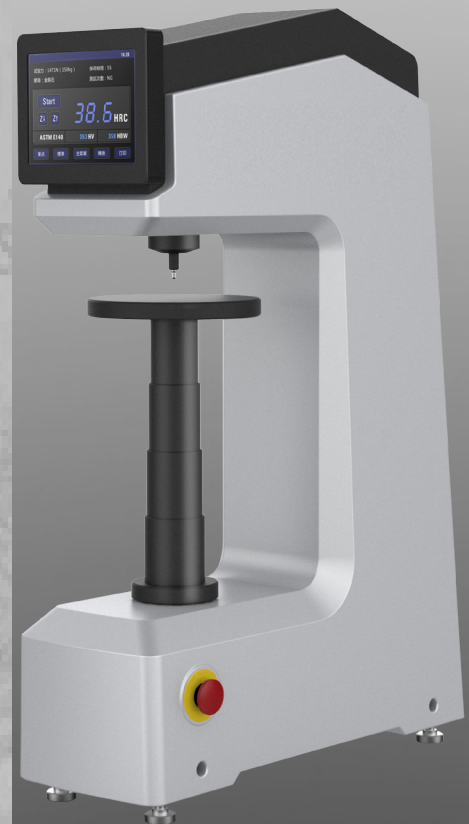
Automated Dual Rockwell / Superficial Rockwell hardness tester

PACE Technologies 3601 E. 34th St Tucson, AZ 85713 USA Phone +1 520-882-6598 FAX +1 520-882-6599 www.metallographic.com email pace@metallographic.com