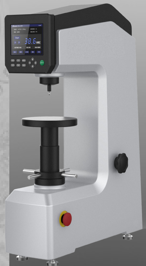
Automated Superficial Rockwell hardness tester

PACE Technologies 3601 E. 34th St Tucson, AZ 85713 USA Phone +1 520-882-6598 FAX +1 520-882-6599 www.metallographic.com email pace@metallographic.com