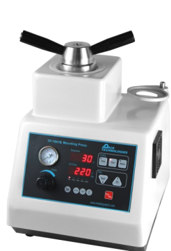
TP-7001B Pneumatic Press