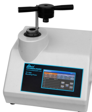
TP-7500 Hydraulic Press with Interchangeable Molds