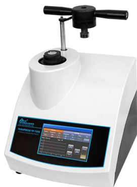
TP-7200 Fixed Mold Hydraulic Press