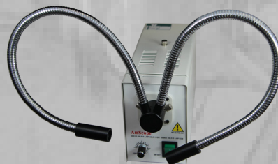
Fiber Optic Illuminator )