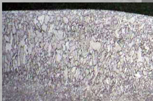
Stereo microscope image of filler metal in a steel weld