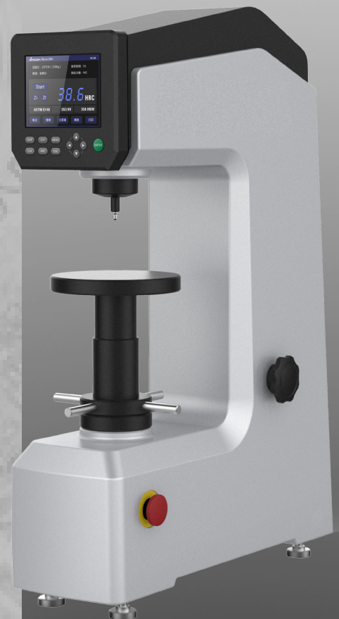
Automated Superficial Rockwell hardness tester

PACE Technologies 3601 E. 34th St Tucson, AZ 85713 USA Phone +1 520-882-6598 FAX +1 520-882-6599 www.metallographic.com email pace@metallographic.com