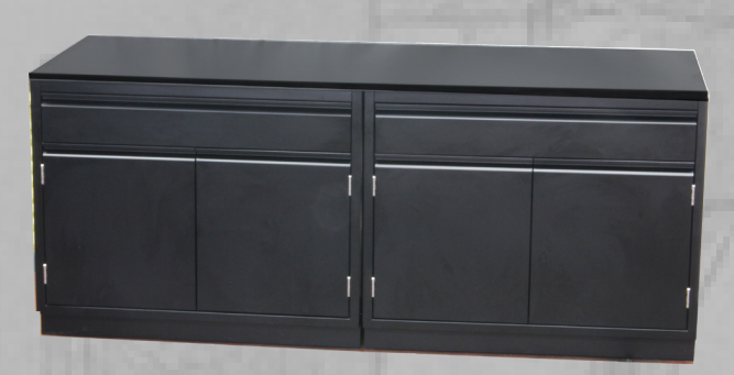
L-BENCH with two double unit cabinets