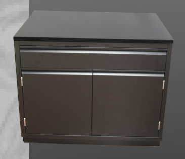
S-BENCH with single double unit cabinet