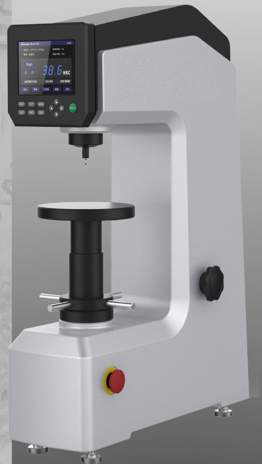
Semi-Automated Rockwell hardness tester

PACE Technologies 3601 E. 34th St Tucson, AZ 85713 USA Phone +1 520-882-6598 FAX +1 520-882-6599 www.metallographic.com email pace@metallographic.com