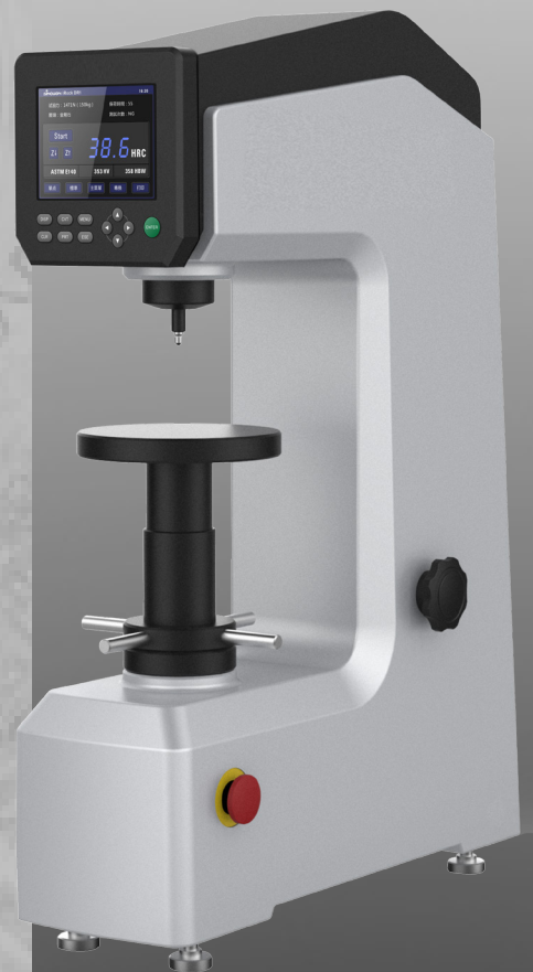
Automated Superficial Rockwell hardness tester

PACE Technologies 3601 E. 34th St Tucson, AZ 85713 USA Phone +1 520-882-6598 FAX +1 520-882-6599 www.metallographic.com email pace@metallographic.com