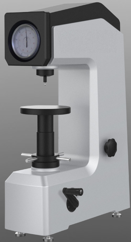
Manual Superficial Rockwell tester

PACE Technologies 3601 E. 34th St Tucson, AZ 85713 USA Phone +1 520-882-6598 FAX +1 520-882-6599 www.metallographic.com email pace@metallographic.com